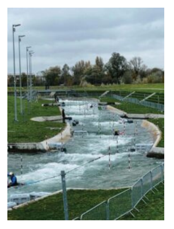
The kayaking facility for the Paris 2024 Olympic Games