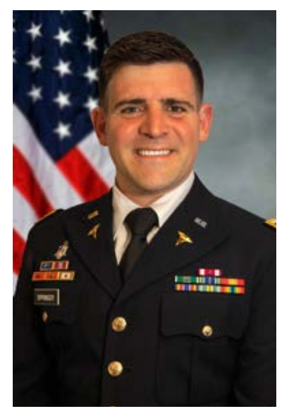
MAJOR JOSHUA SPRINGER

Disclosure: "The views and information presented are those of the authors and do not represent the official position of the U.S. Army Medical Center of Excellence, the U.S. Army Training and Doctrine Command, or the Departments of Army, Department of Defense, or U.S. Government."